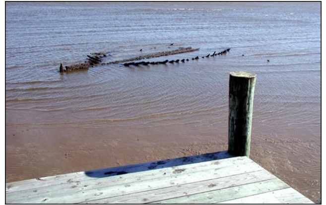
Wreck on the bay shore of Bodkin Point, probably a cargo hauler from the early 20 th century.