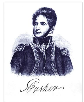
Sir Peter Parker, Commander of HMS Menelaus .

Additional description of this event was discovered in the log